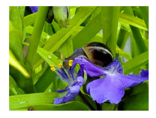
and Gerri submitted photo #8-welcomed visitor